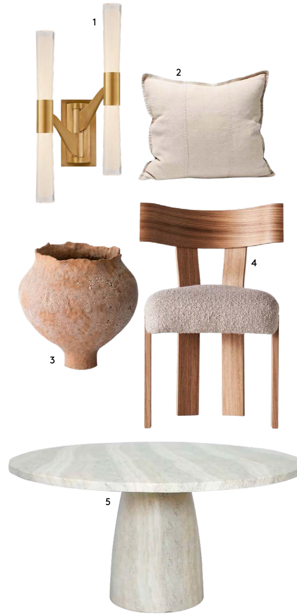
1 Aerin 'Brenta' large double articulating sconce, $3290, The Montauk Lighting Co. 2 Eadie Lifestyle 'Luca' linen cushion in Natural, $109, Domayne. 3 'Sea Spray' sandy raku vessel by Katarina Wells, $950, Curatorial+Co. 4 'Alba' dining chair in Sand/Oak, $3100, Tigmi Trading. 5 'Skyler' round outdoor dining table, $1799, Harvey Norman.