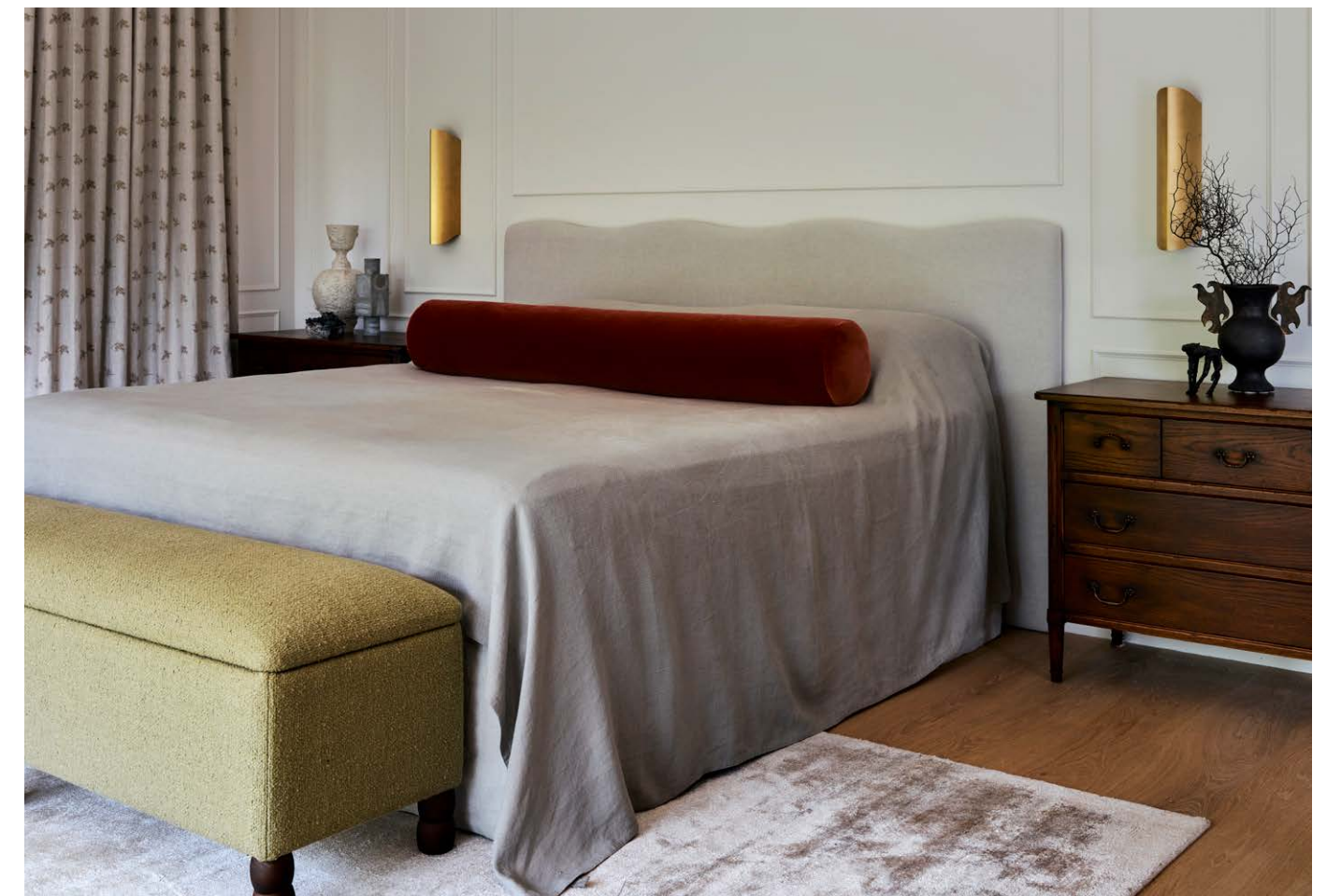
STYLING: CLAIRE DELMAR (ENSUITE)